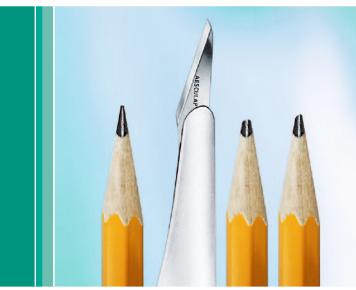
Aesculap Surgical Technologies