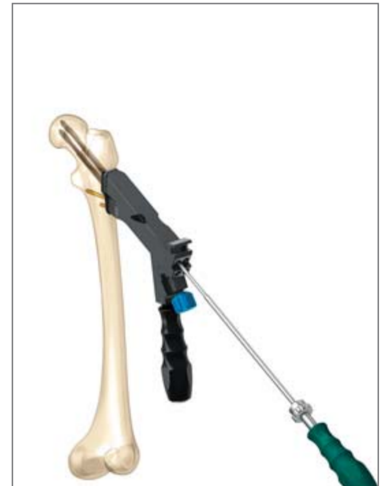
Manually extend TeleScrews