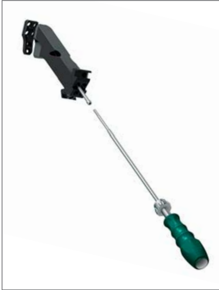
Fixation of plate to aiming jig