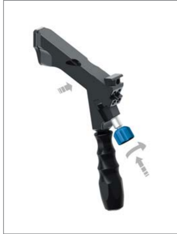
Attach handle to aiming jig