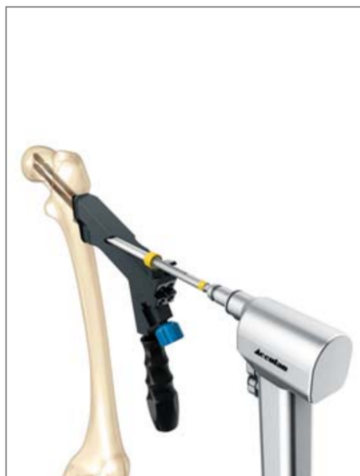
Drill for distal interlocking