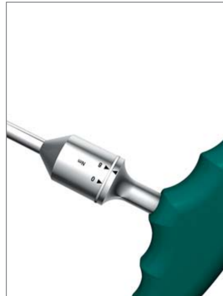
Tighten TeleScrews at 8 Nm